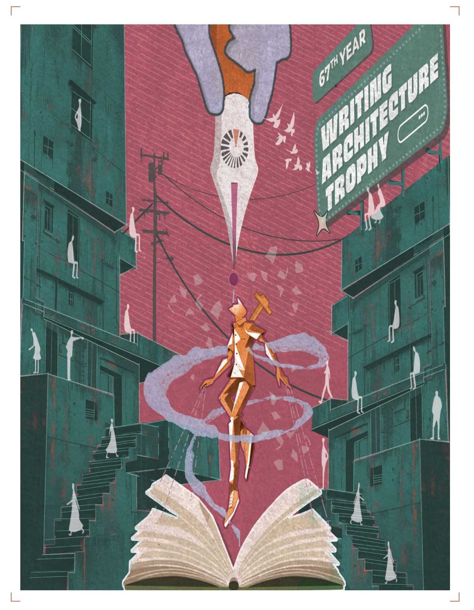
National Association of Students of Architecture Writing Architecture Trophy 2024-25 Exclaim!